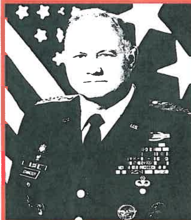
Honorary Chairman GENERAL H. NORMAN SCHWARZKOPF